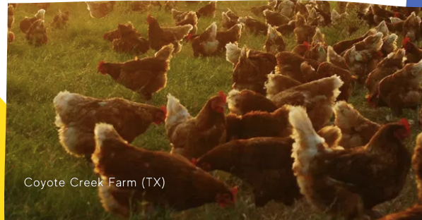
Coyote Creek Farm (TX)

Real Organic dairy cows grazing on pasture.