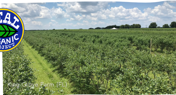
King Grove Farm (FL)

Real Organic blueberries grown in healthy soil.