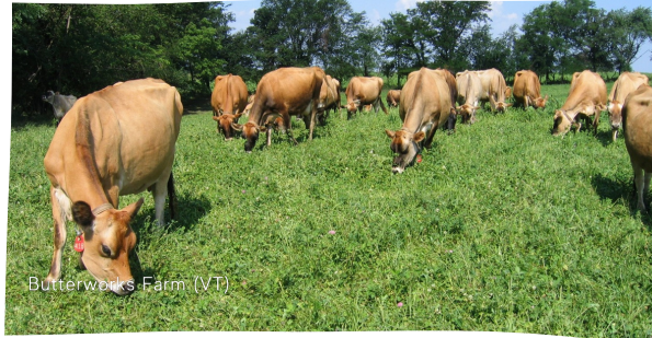
Butterworks Farm (VT)

Real Organic blueberries grown in healthy soil.